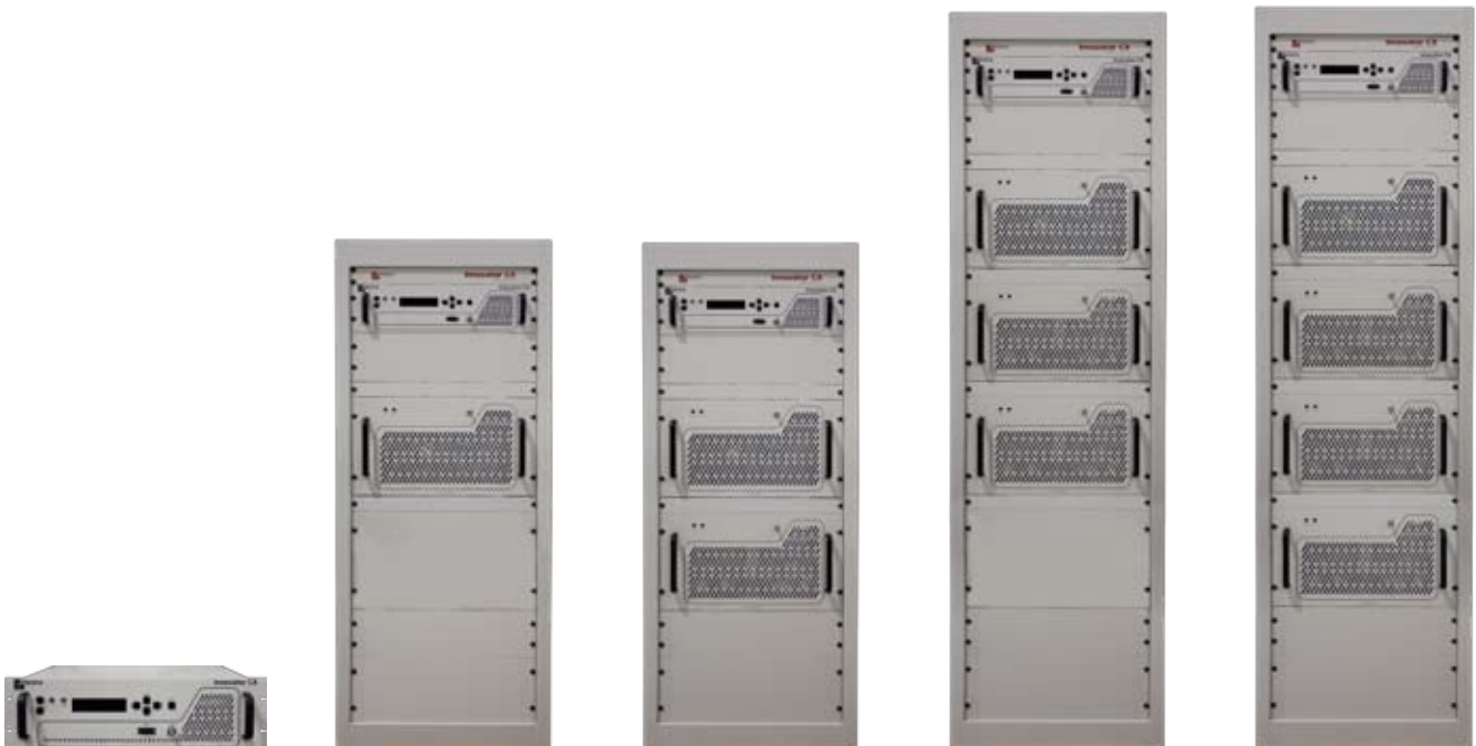
Innovator CX Configurations

Each Innovator CX includes an easily accessible interface designed to work with standard remote control systems, as well as available Web browser and SNMP interfaces.